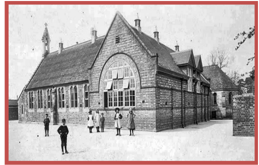
St. Peter's Junior & Infant School in ca 1907, the photo is taken from the canal side. Below in 2009 it is now a private pre-school